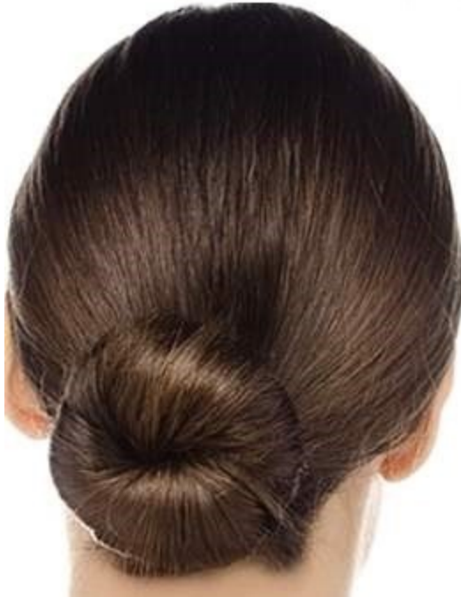
Top or Center Crown